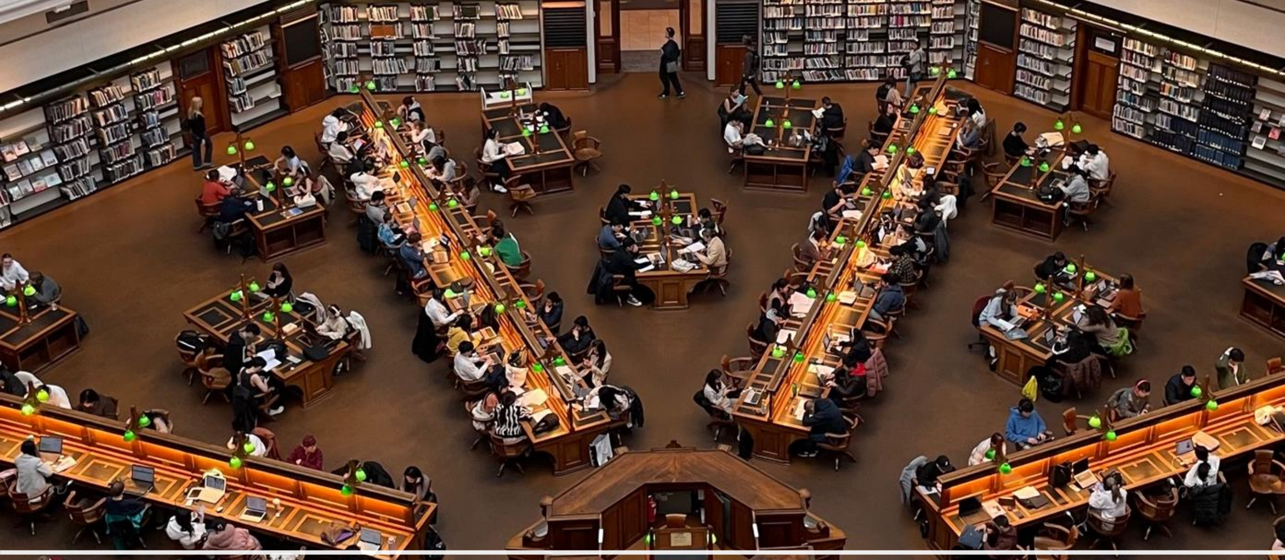
Library of Victoria