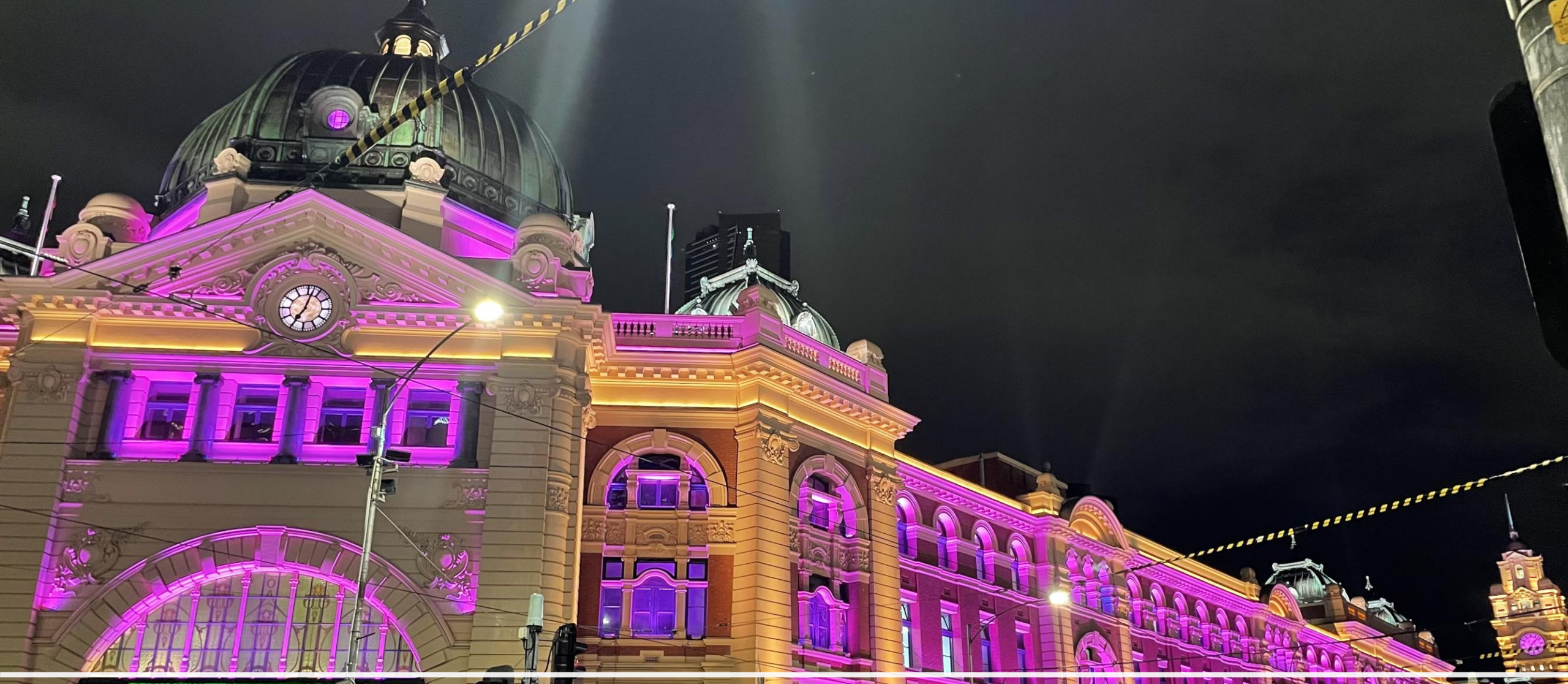
Flinders Street Railway